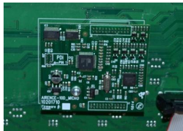
Figure 1 USB pcb